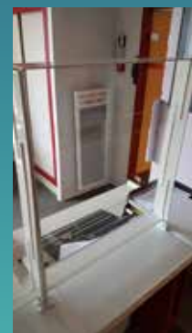
PW3 Stand alone